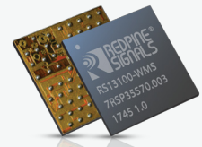
WLCSP (WMS) 3.51 mm X 3.60 mm