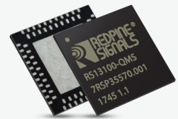
QFN (QMS) 7 mm x 7 mm