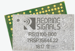
LGA Module (B00) 4.63 mm X 7.90 mm